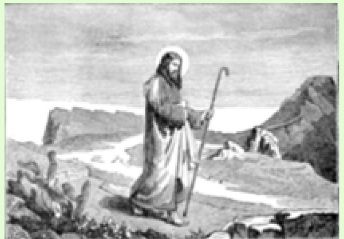
Saint Matthias, Judas' successor